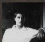
Bl Pier Giorgio Frassati