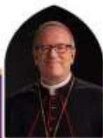
BISHOP ROBERT BARRON