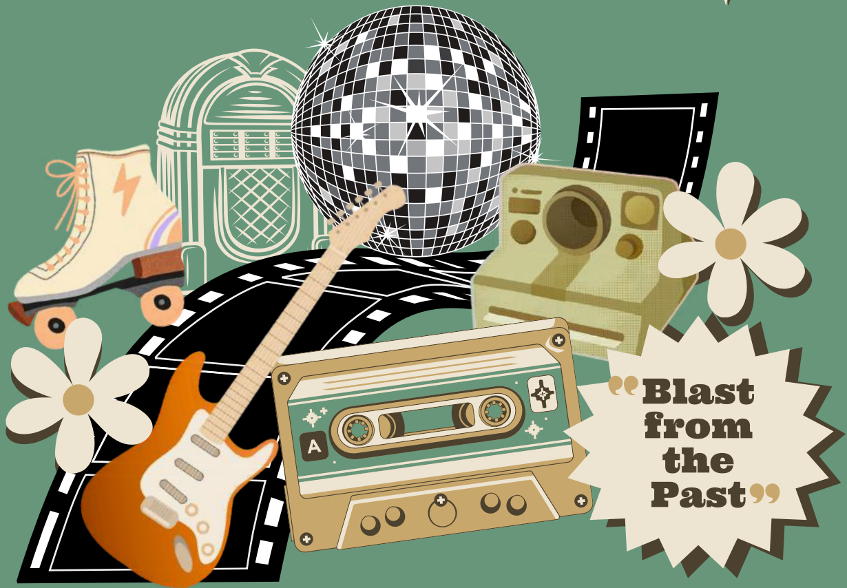
Table for Ten Endowment Night